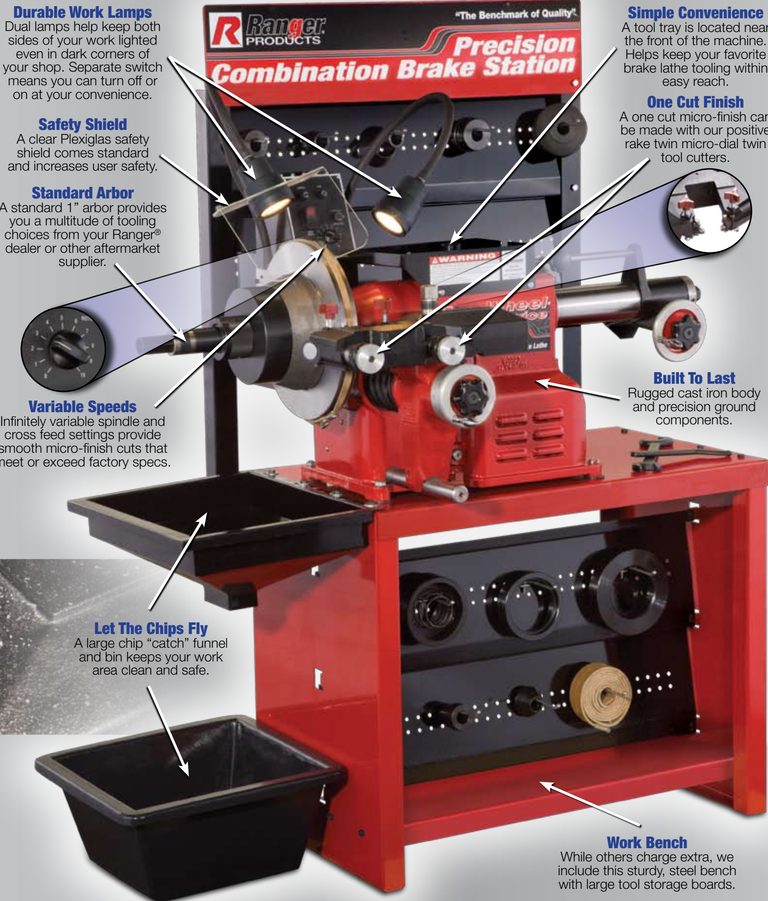
Durable Work Lamps Dual lamps help keep both sides of your work lighted even in dark corners of your shop. Separate switch means you can turn off or on at your convenience.