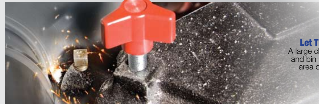
Let The Chips Fly A large chip "catch" funnel and bin keeps your work area clean and safe.

Durable Work Lamps Dual lamps help keep both sides of your work lighted even in dark corners of your shop. Separate switch means you can turn off or on at your convenience.