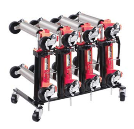
Optional Storage Rack