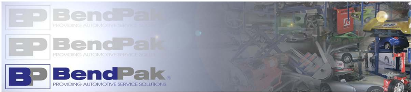
HD-Series Super-Duty Four Post Details